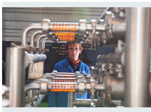
DIRECT DYES ULTRAFILTRATION