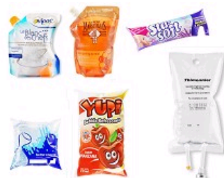
EXAMPLES OF SAMPLES