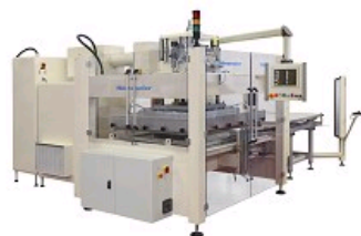
HF WELDING MEDICAL MACHINE