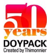
FULL MECATRONIC TECHNOLOGY DOYPACK® (STAND-UP POUCHES) MACHINE