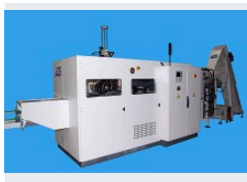
PET STRETCH BLOW MOULDING MACHINE TYPE G64