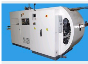
PET STRETCH BLOW MOULDING MACHINE TYPE G64