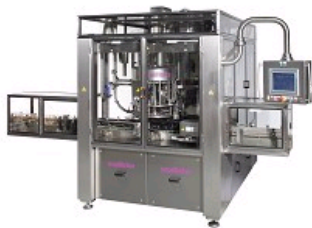
FREE-STANDING SCREW CAPPING MACHINE