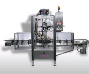
SINGLE-HEAD CAPPER FOR WINE INDUSTRY