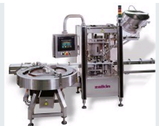
CAPPER FOR PHARMACEUTICAL INDUSTRY