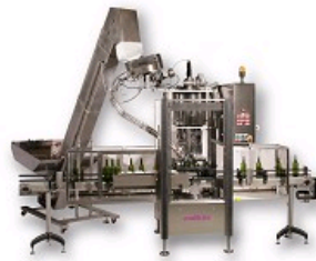
FREE-STANDING SEALING CAPPER