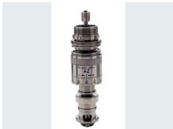
HYSTERESIS SCREW CAPPING HEAD