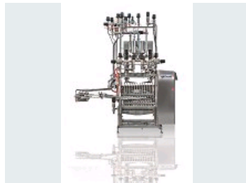
DOSIL FILLER DPDL