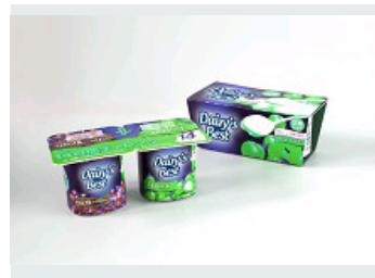
SYNERLINK YOGURT PACK