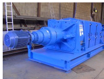
TASSTER(R) SCREW PRESS PFB 750 (NEW MODEL)