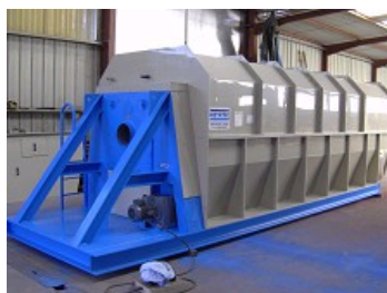
TROMMEL PRETHICKENER RST 2500