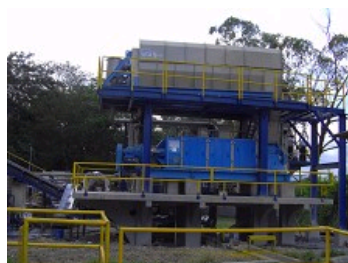
TASSTER PFB 750 + TROMMEL RST 2500