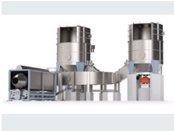
HELI-DRUM: PULPING PERFECTION WITH SUPERIOR INK DETACHMENT & DISPERSION

BoosTEK™ PACK DE PERFORMANCE: DESIGNED FOR FINE SCREENING SYSTEMS ; THIS TECHNOLOGY IMPROVES THE PERFORMANCE OF THE SCREEN.