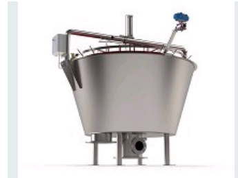
ROTOFLEX™: A NONE ENERGY FIBER RECOVERY DEVICE