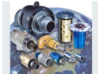
ROTATING UNIONS MONO OR MULTI - PASSAGES FOR ALL TYPE OF APPLICATION