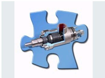
DEUBLIN HPS STEAM CONDENSATE UNION FOR HIGH PRESSURE STEAM

SUPPORTED OR SELF SUPPORTED STEAM AND CONDENSATE UNIONS , ROTATING OR STATIONNARY SIPHONS ,COOLING SYSTEMS FOR CYLINDER ROLLS, STEAM CONDENSATE SURVEY AND ENGINEERING FOR PAPER MACHINE'S DRYING SECTION