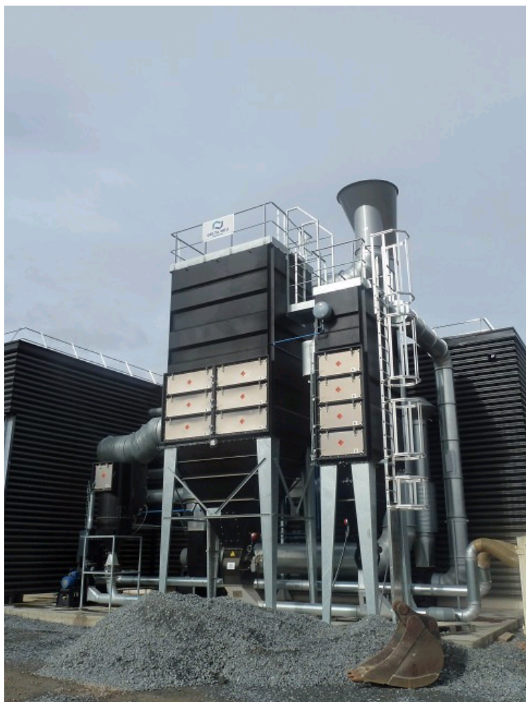
DUST CONTROL AND CENTRALISED VACUUM CLEANING SYSTEMS EXPERIENCE IN ALL TYPES OF DUST CONTROL (FIBROUS, NON FIBROUS, STICKY, EXPLOSIVE, AND HYGROSCOPIC): DUST CAPTURE, TRANSPORTATION, FILTERING, RECOVERY AND AIR RECIRCULATION