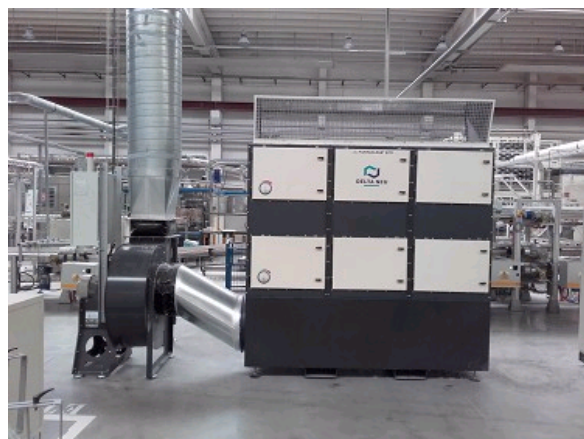
VENTILATION AND NATURAL AIR COOLING TURNKEY INSTALLATIONS TO PROTECT STAFF AND EQUIPMENT AND IMPROVE PRODUCTIVITY