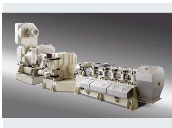
BIVIS MACHINE KRO 200 - EU 240 PAP