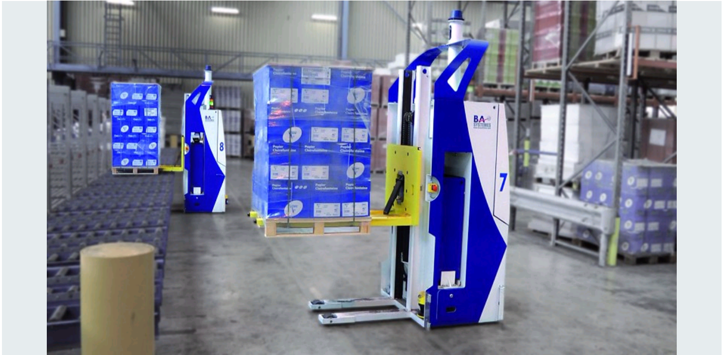
STRADDLE STACKING TRUCK (GL)