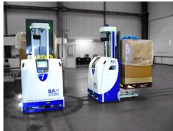
OUTRIGGER AGV (GL)