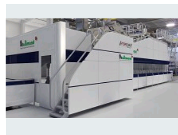
ALLIMAND NONWOVENS MACHINE