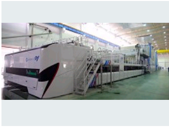
ALLIMAND SPECIALTY PAPER MACHINE WIDTH 3800 MM - SPEED 600 M/MIN