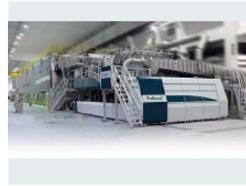
ALLIMAND NONWOVEN PAPER MACHINE WIRE WIDTH 3750 MM - SPEED 600 M/MIN