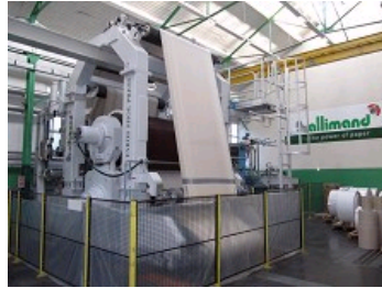
ALLIMAND FAROS SINGLE SHOE PRESS PILOT