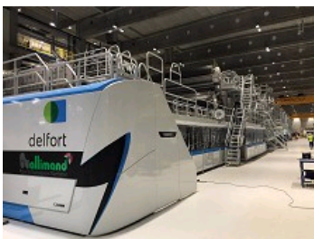
ALLIMAND WRITING PAPER MACHINE - WIDTH 6250 MM, SPEED 1200 M/MIN