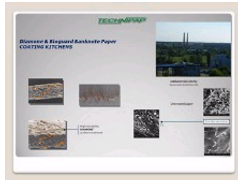
DIAMONE & BIOGUARD COATING KITCHEN - AWS, BANKNOTE FACTORY - MALYN - UKRAINE