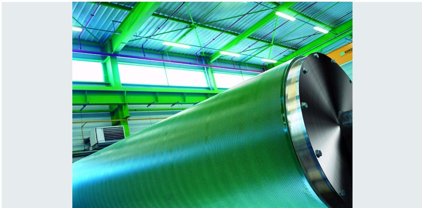
SUCTION PRESS ROLL