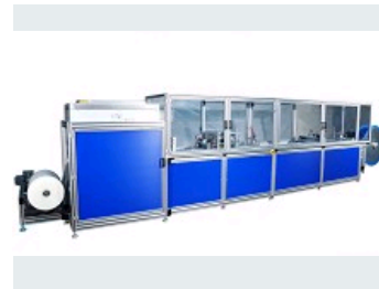
VALVING AND MANUFACTURING LINE FOR ELIPSE®