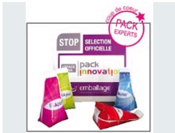
100 TO 500 ML ELIPSE® POUCHES