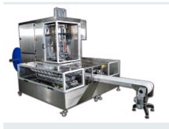
AUTOMATIC ELIPSE® FILLER