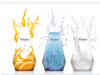
SUITABLE FOR NUMEROUS LIQUID FOOD PRODUCTS