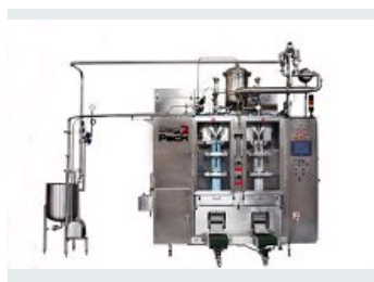
VFFS PACKAGING UNITS FOR PASTEURISED AND STERILISED (UHT - ASEPTIC) LIQUID PRODUCTS IN PILLOW POUCHES