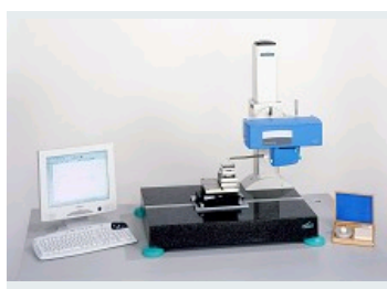
STATIONARY ROUGHNESS AND CONTOUR MEASUREMENT