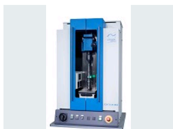
OPTICAL, NON-CONTACT SHAFT MEASURING SYSTEMS