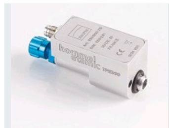
DIGITAL PNEUMO-ELECTRONIC TRANSDUCER