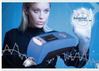
PORTABLE AND RELIABLE SURFACE ROUGHNESS MEASUREMENT