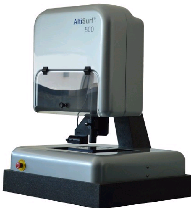
ALTISURF® 500, THE BEST-SELLER