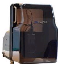
ALTISURF® 50, THE FIRST EMBEDDABLE TECHNOLOGY IN SURFACE METROLOGY