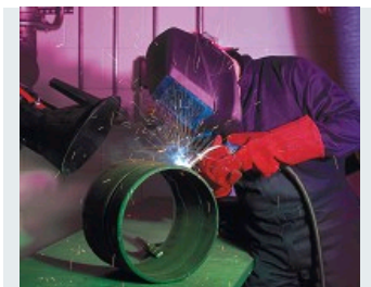
GIVING BETTER METAL FABRICATION RESULTS NO MATTER HOW DEMANDING THE APPLICATION