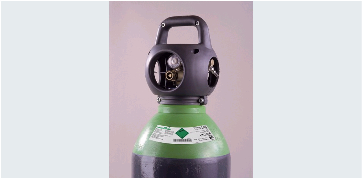
THE INTEGRA® CYLINDER OUR INNOVATION FOR SAFER WELDING