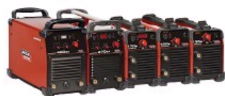
EFFICIENT AND RESISTANT WELDERS