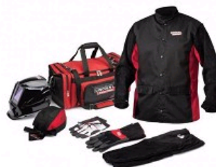
SAFETY EQUIPMENT TO WELD IN SECURITY