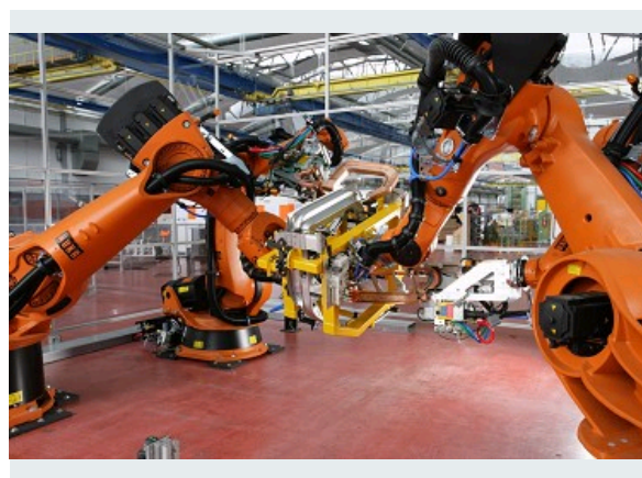
ASSEMBLING BY COOPERATIVE ROBOTS