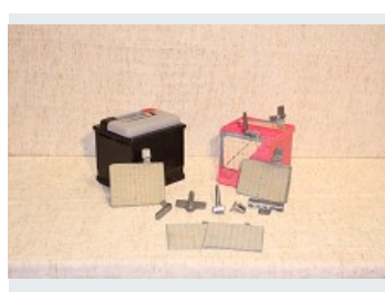
SOLDERING FLUXES FOR BATTERIES MANUFACTURING