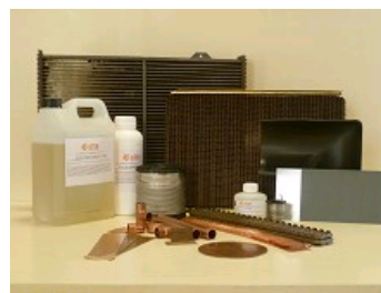
BRAZING FLUXES FOR COPPER, ZINC, TINNING, ETC...