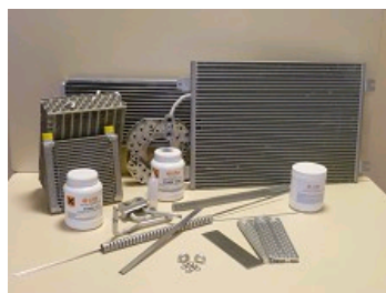
BRAZING FLUXES FOR ALUMINIUM ALLOYS