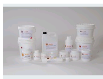
FLUXES WITH CUSTOMER'S BRAND