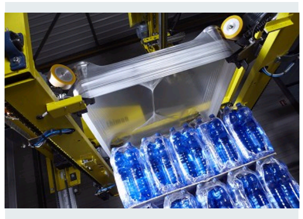
COVER-PAL 6000, STRETCH HOODING