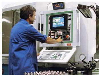
TOOLS ADAPTED TO MODERN NEEDS AND DEMANDING CUSTOMERS