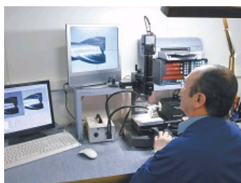
LASER, VIDEOS, CONSTANT QUALITY CONTROL