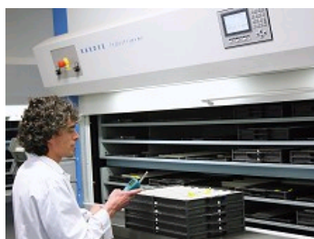
SERVICE RATIO >99%