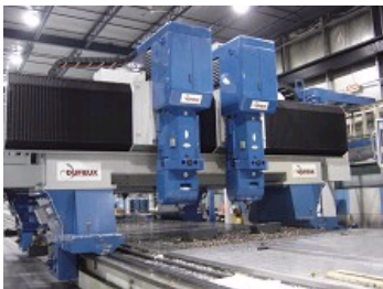
AERO: THE BEST CUTTING-EDGE TECHNOLOGY TO WIN FUTURE AEROSPACE PROGRAMS FOR TITANIUM PARTS MACHINING