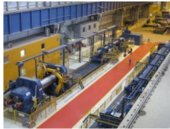
ENERGY: WORLD LARGEST DEEP BORING MACHINE FOR STEEL LONG PARTS (MAXI INSIDE DIAMETER UP TO 2400 MM)