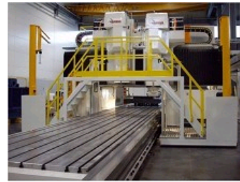
RAIL: HIGHLY PRODUCTIVE TWIN SPINDLE HEAVY MILLING GANTRY TO PROCESS ANY TYPE OF RAIL-TRACK SYSTEMS