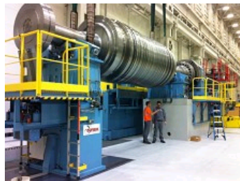
ENERGY: LARGE ROTORS DRILLING CENTRE FOR BLADE FITTING WITH MULTIPLE STATIONS