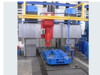
STEEL: HEAVY PORTAL MILLING MACHINES FOR VERY TIGHT ACCURACY JOBS