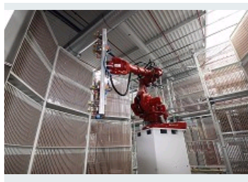
WOOD PANEL STORAGE