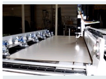
HP WATER CUTTING OF WOOD PANELS