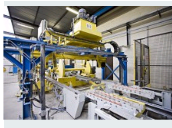
ISOLATED HEAVY LOAD HANDLING SYSTEM