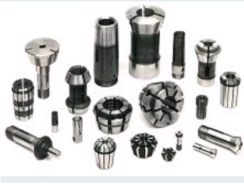
COLLETS AND FEED FINGERS