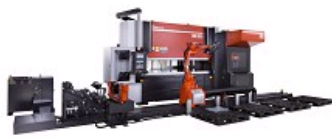
PRESS BRAKE HG-ARS WITH AUTOMATIC TOOL CHANGER AND ROBOT