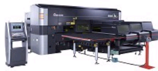
COMBINATION PUNCHING/FIBER LASER LC-2515 C1 AJ