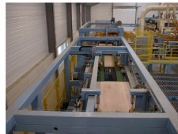
PLYWOOD PRODUCTION LINE