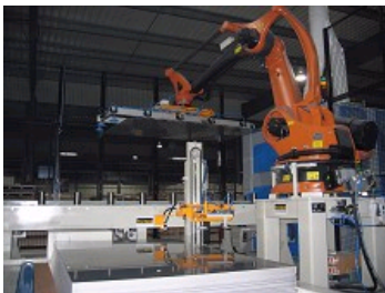
HANDLING ROBOT FOR STAINLESS STEEL SHEETS AND ALUMINUM SHEETS