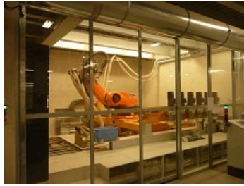
ROBOTIC MACHINING CELL WITH 7 AXES, WITH A 7 MACHINING HEADS CHANGER