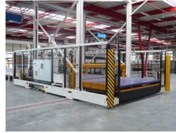
AUTOMATIC SHUTTLE EQUIPPED WITH A CONVEYOR 10 X 4 M, VERTICAL STROKE 4 M