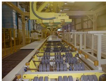
LINE PRODUCTION AND PROCESSING OF MATERIALS