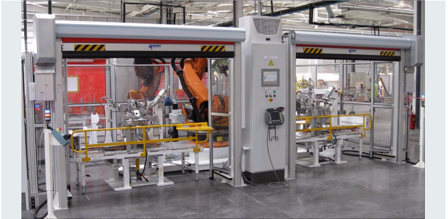
ROBOTIC CELLS WITH EXCHANGEABLE JIGS