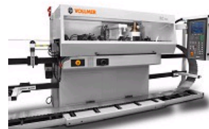
NEW MACHINES AND RETROFITTED MACHINES