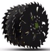
TCT CIRCULAR SAW BLADES, WITH OR WITHOUT SCRAPPERS