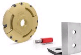
PROFILE-CUTTERS AND CUTTER HEAD, CHIPPER KNIVES, TUNGSTEN CARBIDE TIPS