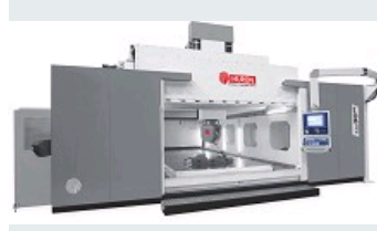
KXG - GANTRY MILLING CENTRE FOR COMPLEX WORKPIECES IN AEROSPACE FIELD