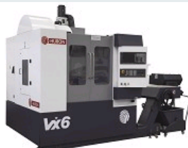
VX 6 - SIMPLE AND EFFICIENT MILLING CENTRE