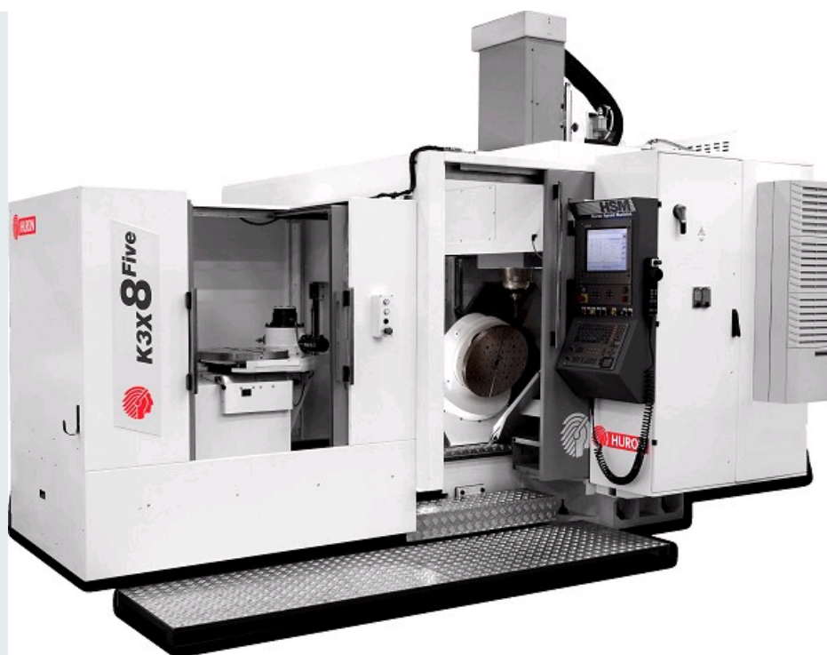
K3X 8 FIVE - NEW GENERATION OF MILLING CENTRES WITH INTEGRATED BI-PALLET SYSTEM