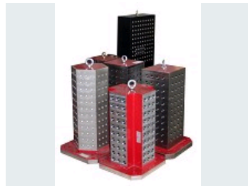
MODULAR CLAMPING EQUIPMENT OML