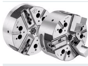
HIGH PRECISION SEALED POWER CHUCKS