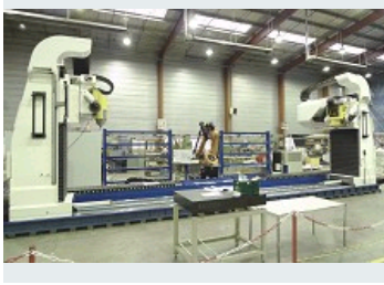
LEAN CENTER DRILLING INGENEERING AND MANUFACTURING OF THE SUPPORTING STRUCTURE