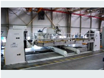
GEMCOR RIVETER COMPLETE RECONSTRUCTION OF THE SUPPORTING STRUCTURE