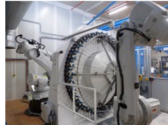
COMPOSITE BRAIDING CELL