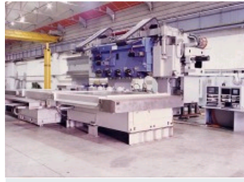
PORTAL-FRAME-TYPE MILLING MACHINE DROP&REIN COMPLETE RECONSTRUCTION AND 5-AXIS UPGRADE