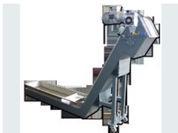
MAGNETIC CONVEYORS ARE IDEAL FOR SMALL CHIPS