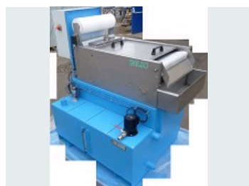
CENTRAFLEX® - COOLANT STATION