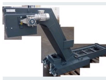
CONVEYORS ARE IDEAL FOR SHORT AND FRACTIONATED CHIPS