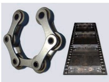
BELT, SCRAPER, CHAIN DRIVEN ETC..