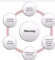
PLANNING AND WORKFLOW