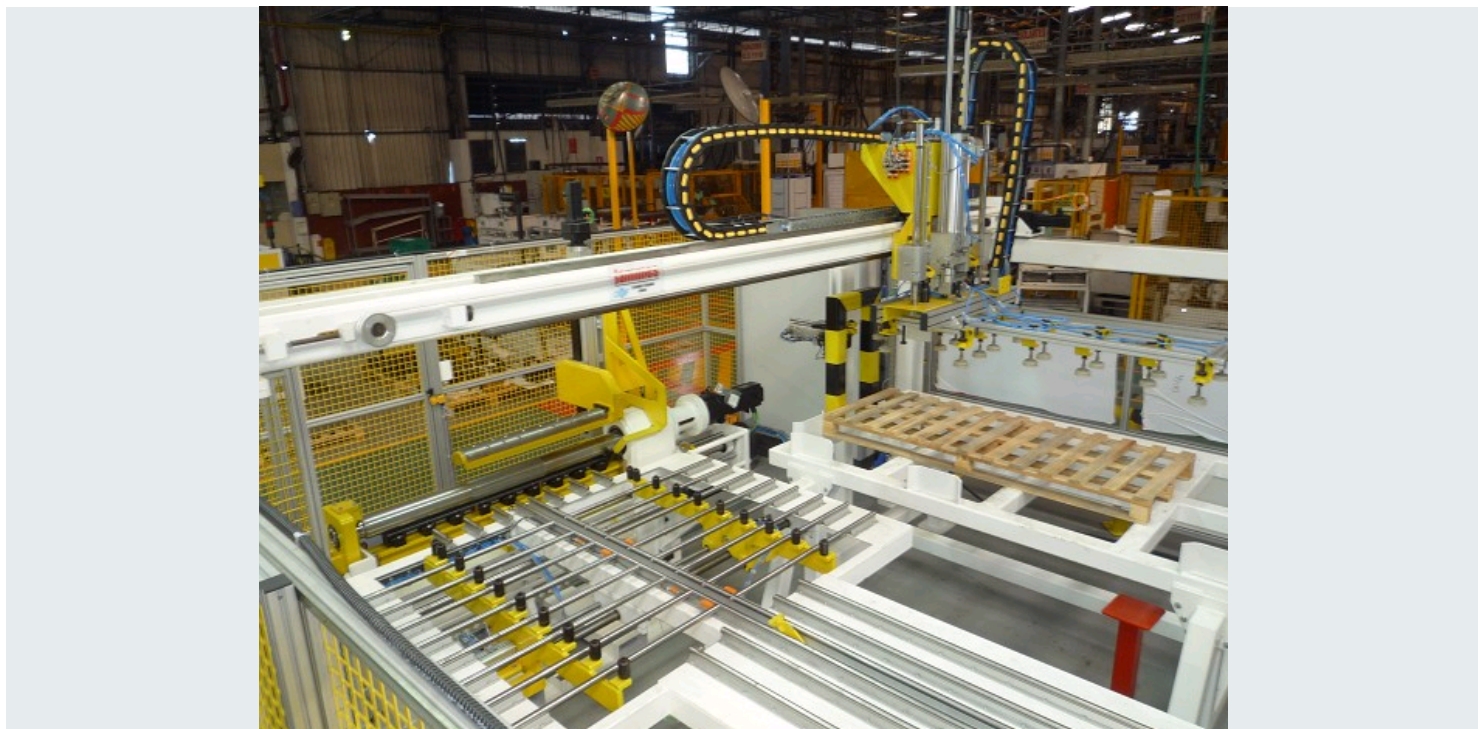
JAMMES ROLLING AND WELDING LINE