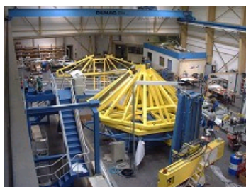
ARIANE V WELDING MACHINE