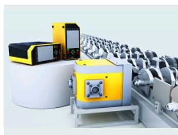
M4 INLINE, DOT PEEN MARKING MACHINE DEVELOPED FOR INTEGRATION