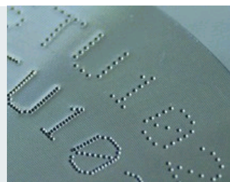
DOT PEEN ALPHANUMERICAL MARKING