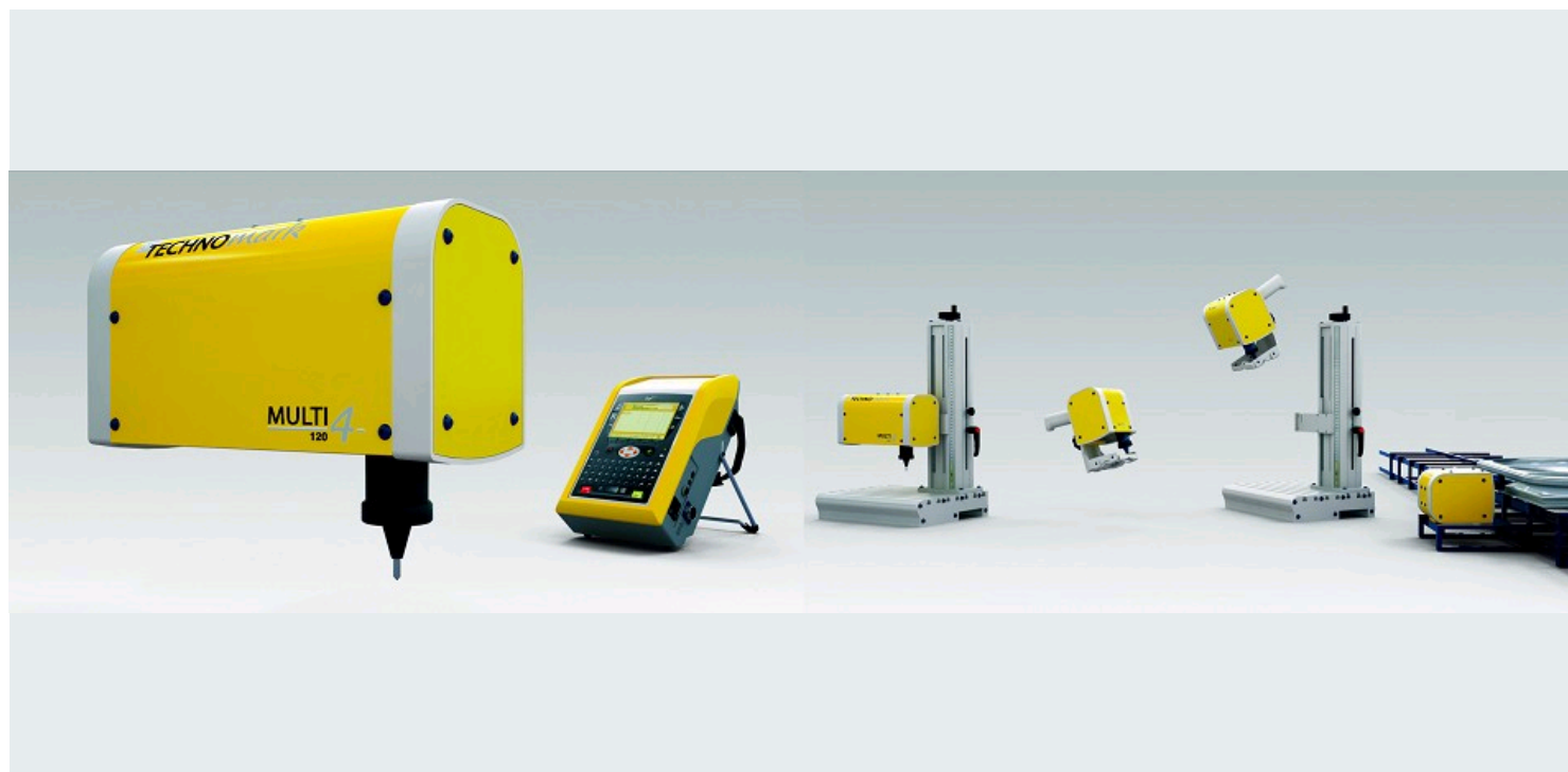
MULTI4, THE NEW RANGE OF DOT PEEN AND SCRIBING MARKING EQUIPMENT