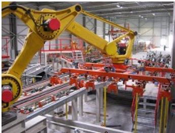
AUTOMATED PACKAGING LINE