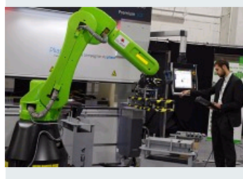
INTEGRATION OF A COLLABORATIVE ROBOT