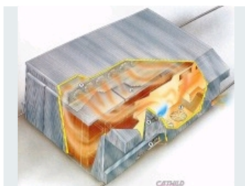
MGTT KILN SCHEME (MOISTURE GAZ THERMAL TRANSFER)

HIGH CAPACITY LOW TEMPERATURE KILN DEDICATED TO SOFTWOODS DRYING, EVERY CUTTINGS UP, EVERY MOISTURE CONTENT WITHIN SHORT DELAYS WITH OPTIMAL QUALITY. REDUCED HANDLING