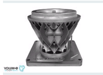
CARTER PROMETHEUS // ARIANEGROUP