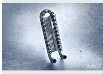
HEAT EXCHANGER // INTERNAL PROJECT