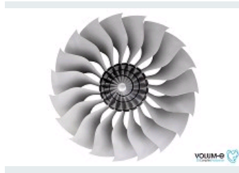
TURBO FAN // INTERNAL DEMONSTRATION PIECE