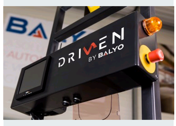
THE MOVEBOX MODULE "DRIVEN BY BALYO"