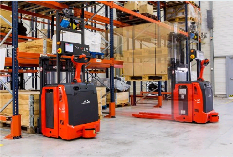
ROBOTIC STACKING OF PALLETS IN RACKS