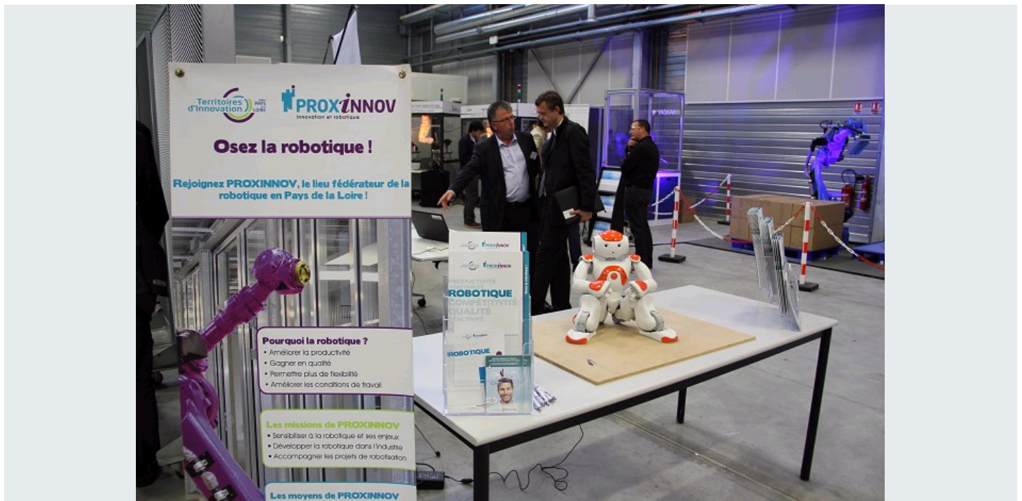
PROXINNOV - FRENCH PLATFORM ROBOTICS