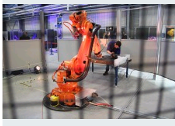
TEST ON THE PLATFORM PROXINNOV