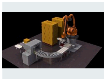
CARDBOARD PALETTISING CELL