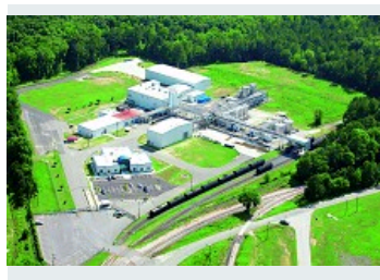
CHESTER (SOUTH CAROLINA USA)