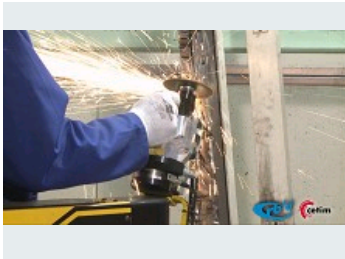
6 AXIS COLLABORATIVE ROBOT FOR GRINDING