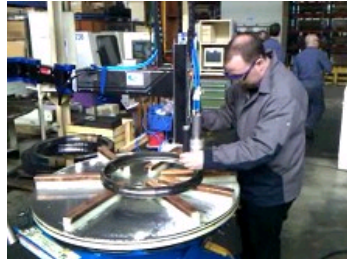
1 AXIS COLLABORATIVE ROBOT