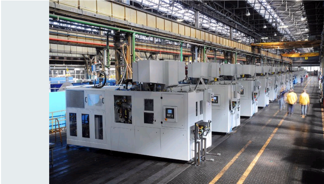
SMART DRIVE COMAU