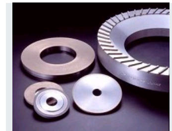
CBN METAL BOND WHEELS