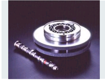
CBN VITRIFIED WHEEL