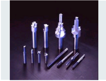
PCD, PCBN CUTTING TOOLS & REAMERS