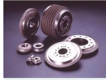
CBN ELECTROPLATED WHEELS